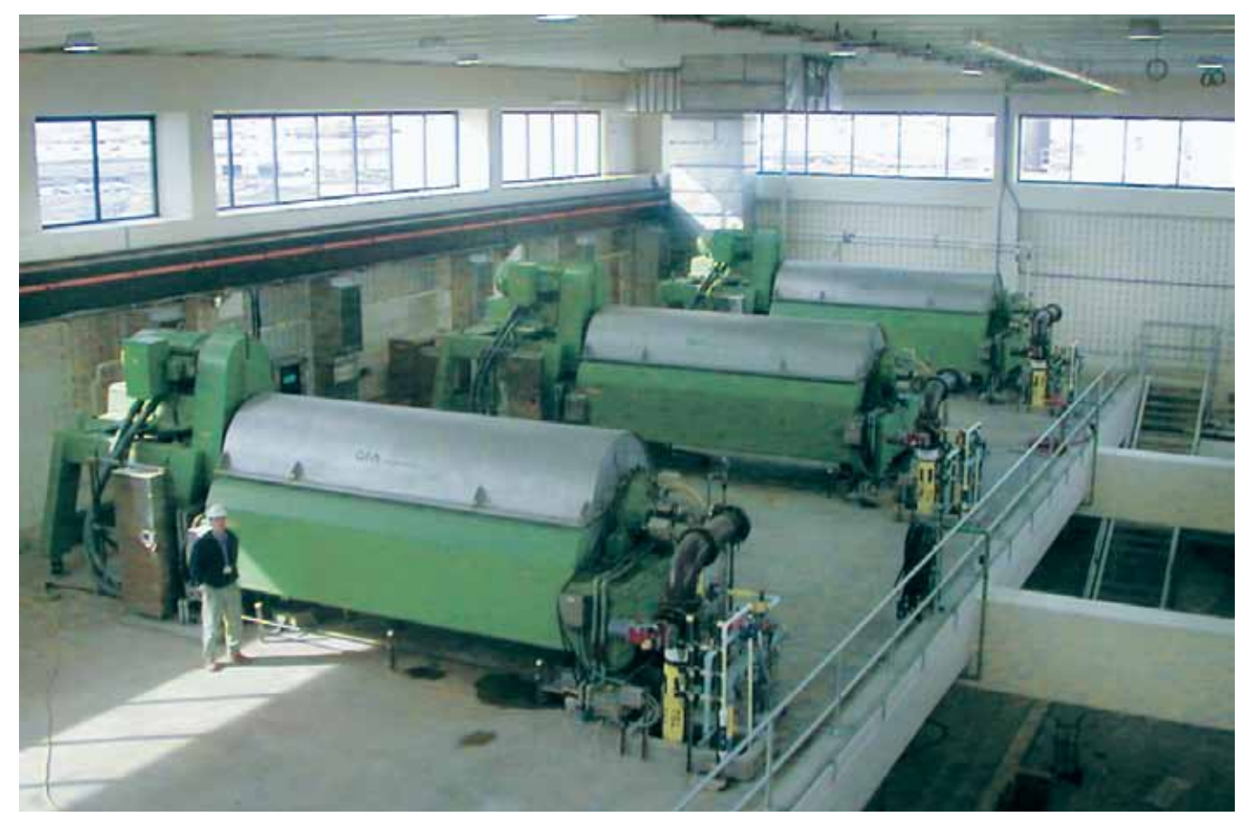
The PVSC water resource recovery facility uses four thickening centrifuges that play a critical role in its solids treatment train. PVSC