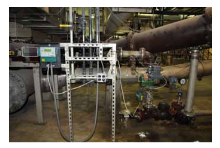
A full-scale test program of the new meter, left, was conducted on one centrifuge.

The meter confirmed the root cause of the problem as volatile entrained air bubbles trapped in the sludge. To correct the problem, the pressure in the meter sample line was increased to 1.5 bar (22.5 lb/in.<sup>2</sup>) to collapse the air bubbles back into the solution.